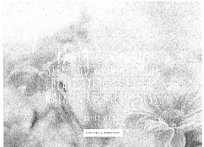
President Dieter F. Uchtdorf